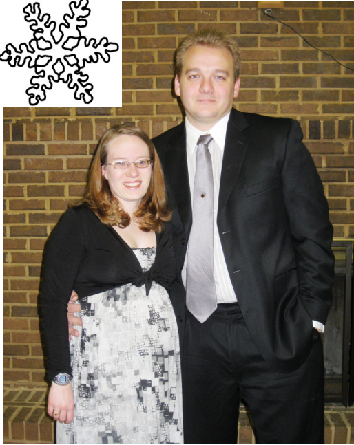
W I N T E R